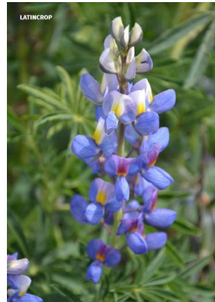
Figure 4. Front and back cover of the LATINCROP Andean cookbook prepared by Melting Pot Bolivia together with Gustu restaurant, and with assistance from the other project partners.