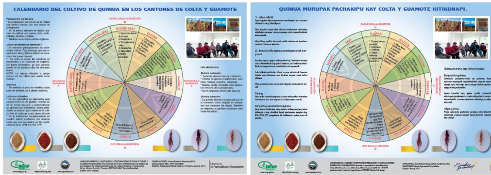
Figure 2. Agricultural calendars for quinoa crop at Colta and Guamote (Chimborazo province, Ecuador) conducted by INIAP. Spanish and Quechua versions.