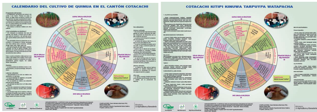
Figure 3. Agricultural calendar for quinoa crop for Cotacachi (Imbabura province, Ecuador) conducted by INIAP.