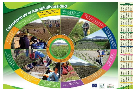
Figure 1. Calendar on Integrated crop management at centers of agrobiodiversity. Bolivia. Fundación PROINPA, 2017-2018.