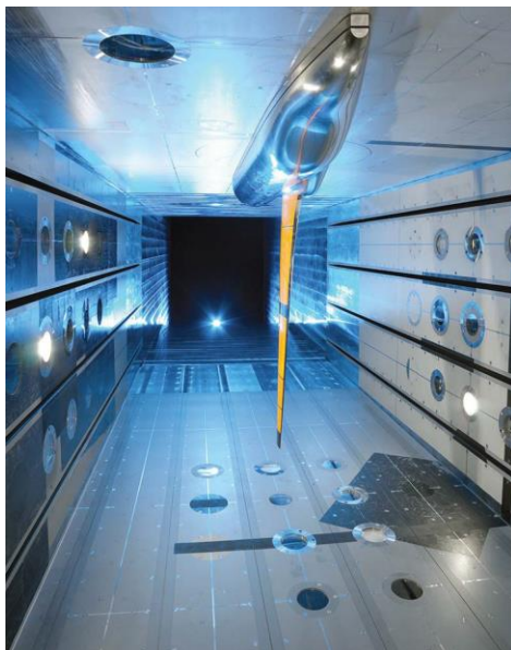
Figure 2: Half model with laminar wing mounted in the test section of the ETW